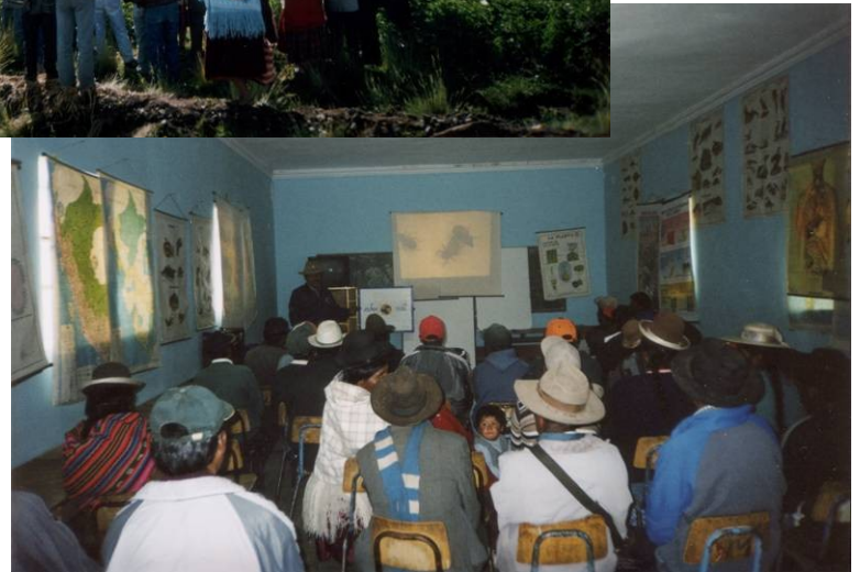
education of farmers