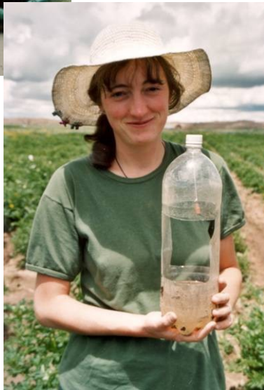
field research (potato pests)